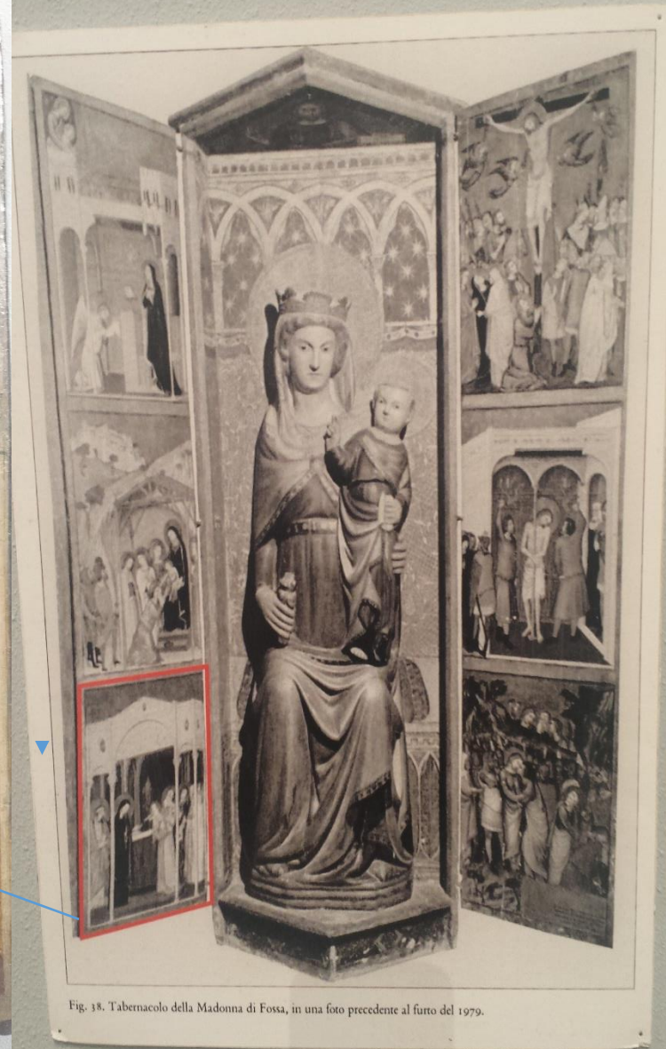
Fig. 18. Tabernacolo della Madonna di Fossa, in una foto precedente al furto del 1979.