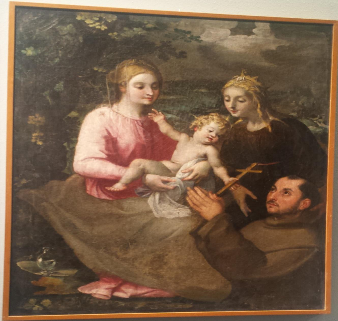
Hans Memling Madonna and Child with Saint Elizabeth and the Christ Child c. 1480-1490 Oil on panel, 45 x 55 cm The painting depicts the Visitation, the meeting of the Virgin Mary and Saint Elizabeth. The figures are shown in a domestic setting, with the Virgin Mary seated on the left and Saint Elizabeth on the right. The Christ Child is held by the Virgin Mary. The kneeling figure in the foreground is likely a donor or a saint. The background is a dark, wooded landscape. A small glass vessel is on the ground in the lower left corner.